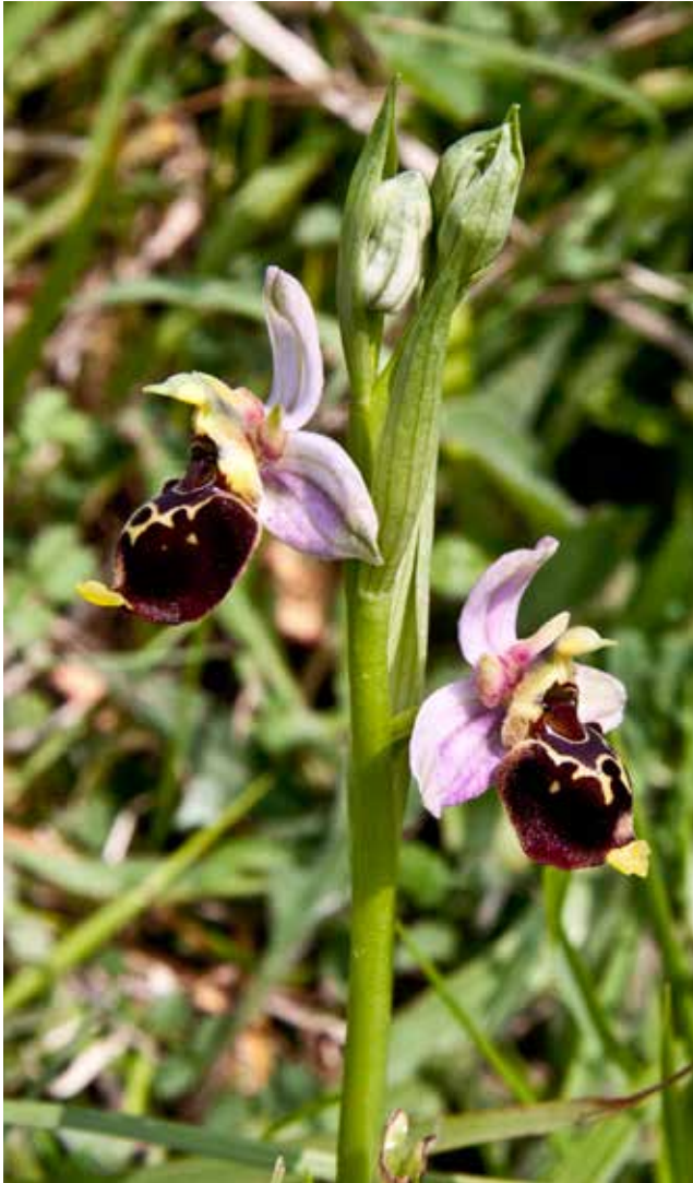
One of last year's photos a Late Spider Orchid at one of the few places they grow in this country

MATERIAL FOR THE FEBRUARY 2014 ISSUE should be left at Goudhurst Newsagents or at Russets, North Road by WEDNESDAY 15th JANUARY.